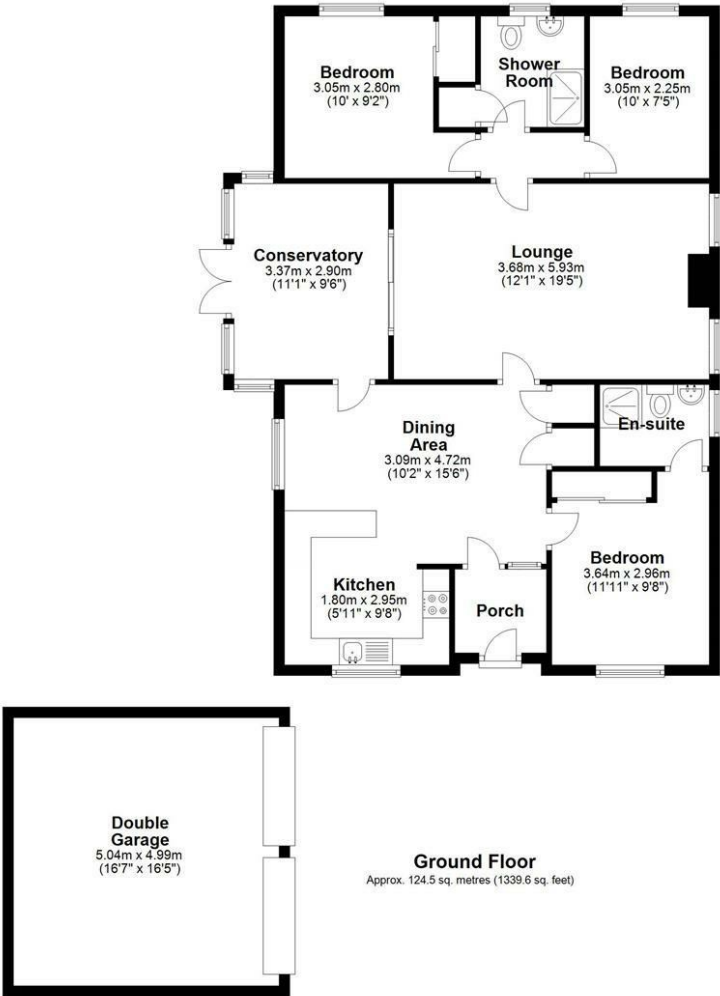
Total area: approx. 124.5 sq. metres (1339.6 sq. feet)